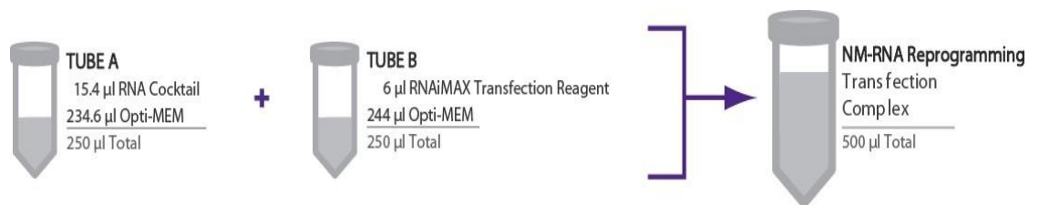
FIGURE 3. NM-RNA Reprogramming cocktail set-up