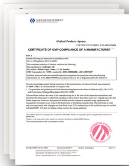
GMP for ATMP Certificate